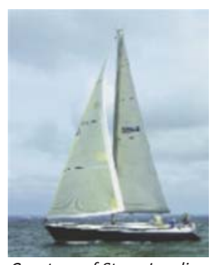
Market Value: $600