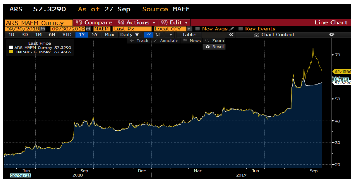
Chart showing both the ARS MAE Fixing and the Blue chip swap rate for the last several years

Please see chart below depicting the divergence of the official exchange rate and the "Blue Chip Swap" rate.