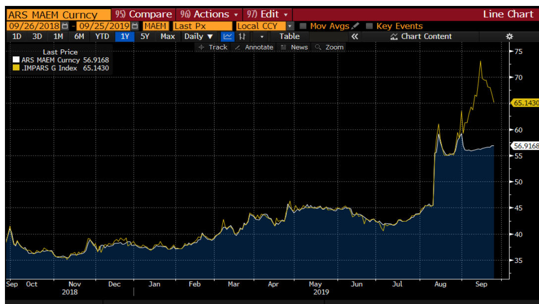
Chart showing both the ARS MAE Fixing and the Blue chip swap rate for the last several years

Please see chart below depicting the divergence of the official exchange rate and the "Blue Chip Swap" rate.