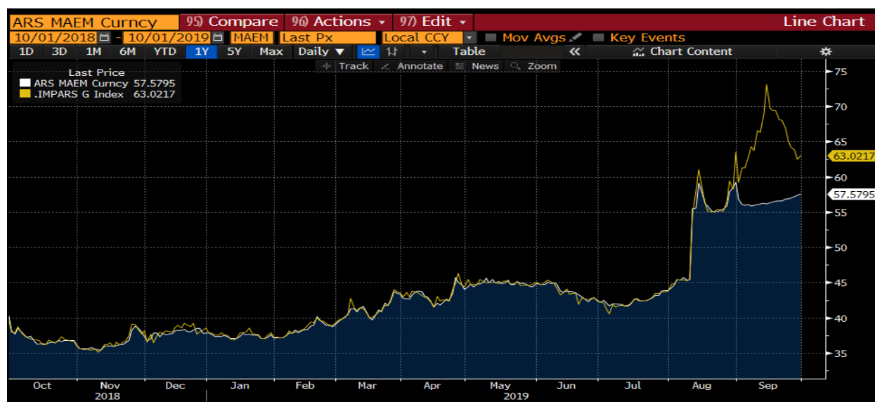
Chart showing both the ARS MAE Fixing and the Blue chip swap rate for the last several years

Please see chart below depicting the divergence of the official exchange rate and the "Blue Chip Swap" rate.