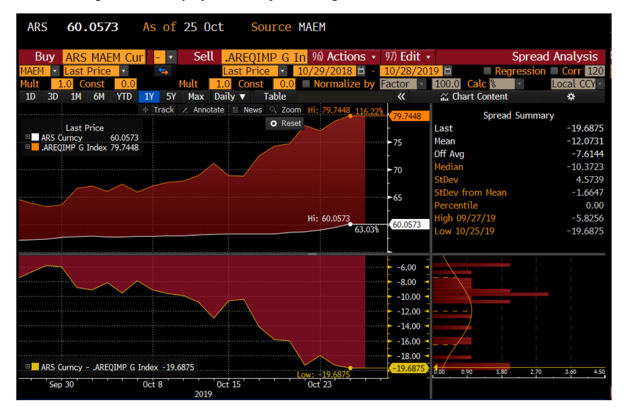
Chart showing more recent performance of the divergence in FX rates

Chart showing both the ARS MAE Fixing and the Blue Chip Swap rate for the last several quarters