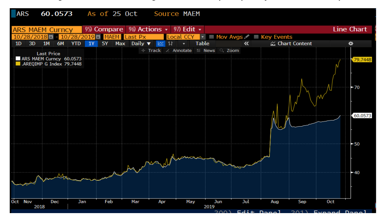
Chart showing both the ARS MAE Fixing and the Blue Chip Swap rate for the last several quarters