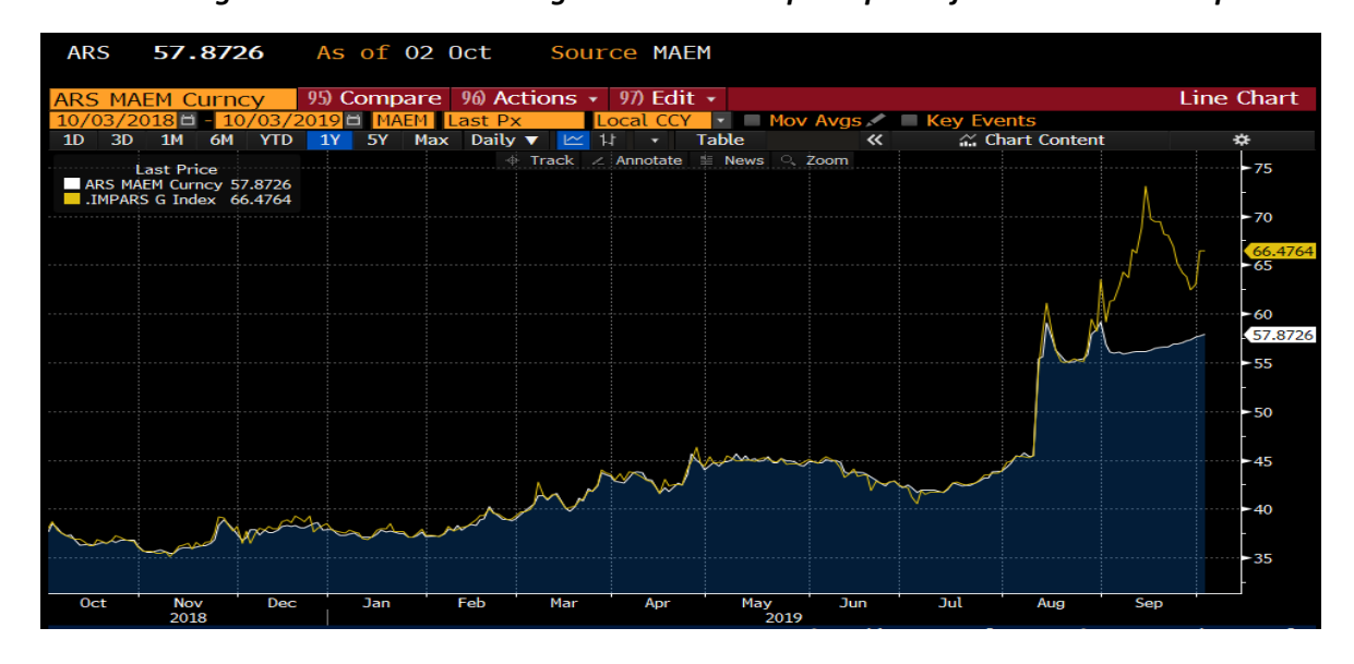
Chart showing both the ARS MAE Fixing and the Blue chip swap rate for the last several quarters

Please see chart below depicting the divergence of the official exchange rate and the "Blue Chip Swap" rate.