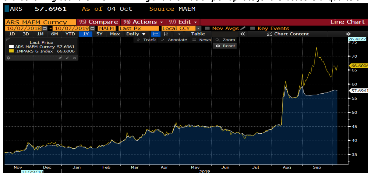
Chart showing both the ARS MAE Fixing and the Blue chip swap rate for the last several quarters

Please see chart below depicting the divergence of the official exchange rate and the "Blue Chip Swap" rate.