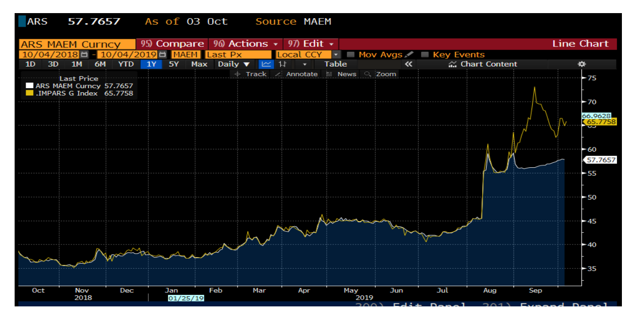
Chart showing both the ARS MAE Fixing and the Blue chip swap rate for the last several quarters

Please see chart below depicting the divergence of the official exchange rate and the "Blue Chip Swap" rate.