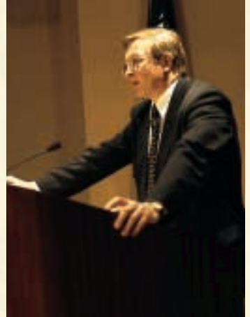
ALEXANDER N. SHOKHIN

“There are now many new opportunities for Emerging Markets traders. ...We in Russia are very interested in working together with EMTA to demonstrate the role of the Russian financial markets and Russian debt instruments in the world marketplace.”