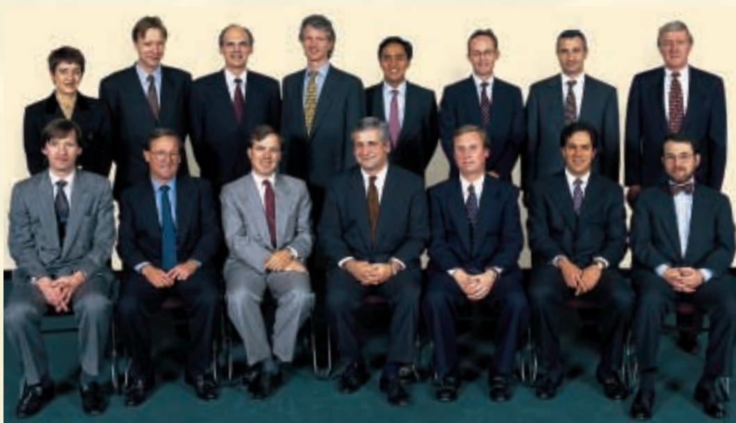
Pictured at EMTA's 1994 Annual Meeting in New York City are EMTA Directors: